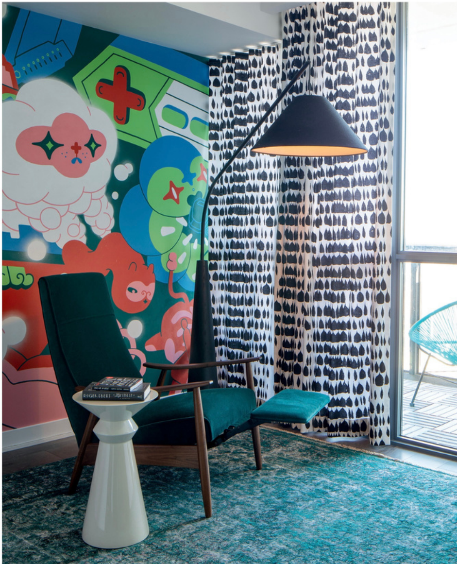
The black and white Queen of Spain drapery fabric provides contrast in Robin's office without competing with the wall mural. Drapery fabric , Schumacher; mural by Wenting Li.

THE AMENITIES: "The pool area is beautiful and has barbecues and an outdoor fireplace," says Amelia. "It's secluded with nice trees; kind of like a hotel pool."